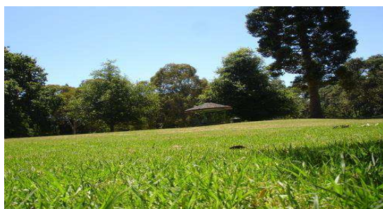
View of part of Cornwall Park

The College has a highly qualified and experienced Academic Faculty who are specialists in their field. Continued professional development in both subject content and educational, academic and clinical practice is a unique distinctive characteristic of NZCCM.