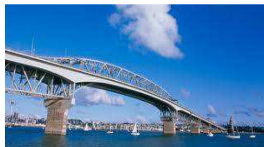
Auckland Harbour Bridge