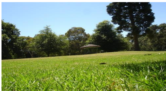
View of part of Cornwall Park

The College has a highly qualified and experienced Academic Faculty who are specialists in their field. Continued professional development in both subject content and educational, academic and clinical practice is a unique distinctive characteristic of NZCCM.