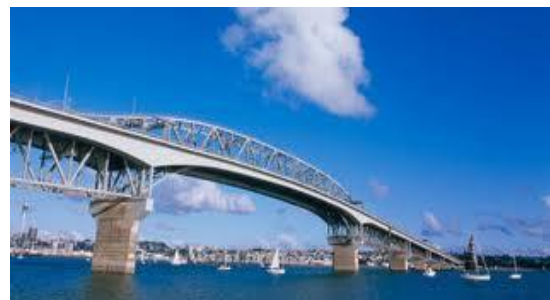
Auckland Harbour Bridge