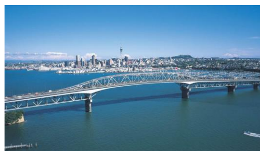
Auckland Harbour Bridge