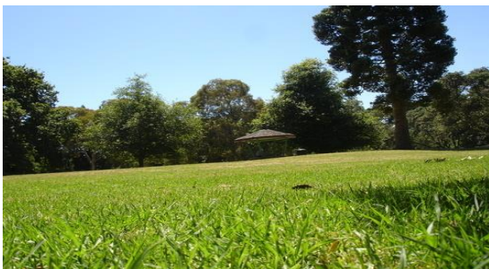
View of part of Cornwall Park

The College has a highly qualified and experienced Academic Faculty who are specialists in their field. Professional teaching staff are practitioner educators who work, research and educate in their fields. Professional practise in the discipline they now teach increases the quality of teaching. This can be a powerful influence for students embarking on a career in healthcare. In addition, all faculty in the BHSc and MCM are research active and bring their research interests into the teaching. Continued professional development in both subject content and educational, academic, and clinical practice is a unique distinctive characteristic of NZCCM.